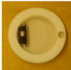
Figure5. Original Rotation sensor form

The switching of the images and the effects are done according to the value of the rotation sensor when it detects the ball passing and the ID stored on the table in the application. By switching the slide switch on, the ID, from the ball type object in the maracas, is stored in the image group or the effect group on the table in the application through the RFID module (Figure 3). Immediately after the storage is in the default state, so the image and the effect with the smallest number of ID on the table becomes active and is output to the projector. Then the ID will switch in order when a rotation is detected in the rotation sensor.