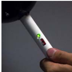
Figure3. STEP2: Object ID can be loaded by switching to on