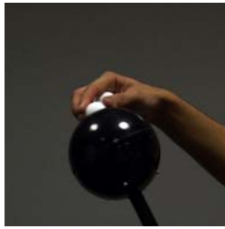
Figure2. STEP1: Insert the object to the maraca.

*the parentetic part shows the rate of change